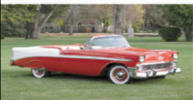
1956 Chevy Bel Air