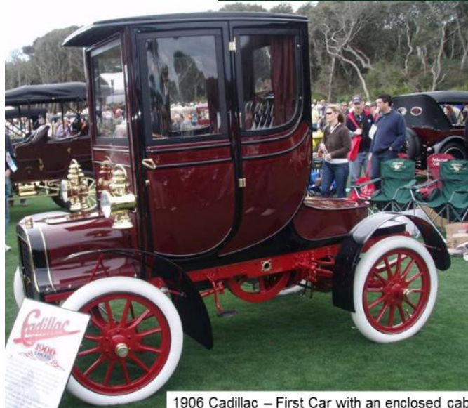
1906 Cadillac – First Car with an enclosed cab