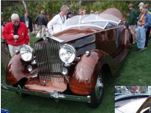
1936 Rolls Royce made of Peruvian Walnut