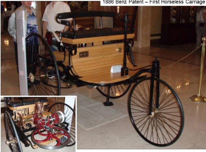
1886 Benz Patent – First Horseless Carriage