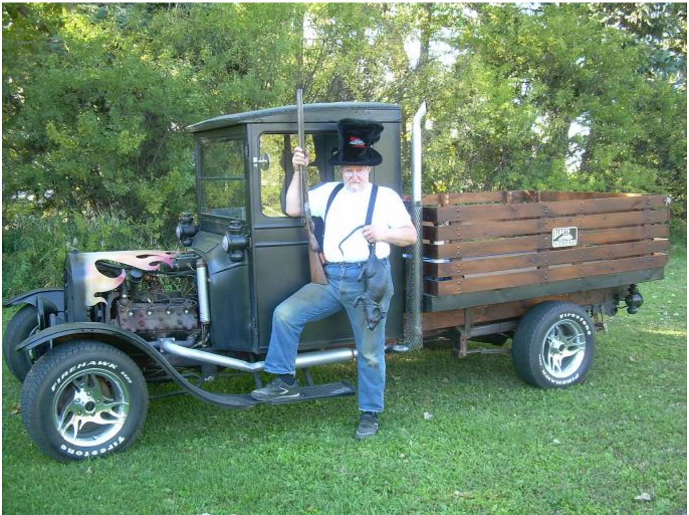
Hey! It'll keep the mice out of the cars for the winter!

Plans for the 2011 Season Finale are already underway. Take a look at what's going to be on the menu!