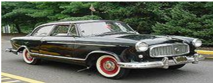
1950s Rambler American with vintage aftermarket "curb feeler"

The status of whitewall tires versus blackwall tires was originally the reverse of what it later became, with fully black tires requiring a greater amount of carbon black and less effort to maintain a clean appearance these were considered the premium tire; since the black tires first became available they were commonly fitted to many luxury cars through the 1930s. During the late-1920s gleaming whitewalls contrasted against darker surroundings were considered a stylish, but high-maintenance feature. The popularity of whitewalls as an option increased during the 1930s, while automobile streamlining and skirted fenders eventually rendered the two-sided whitewall obsolete.